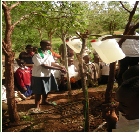
Practical demonstration on installation of kibuyu chirizi in Ngulu Primary School