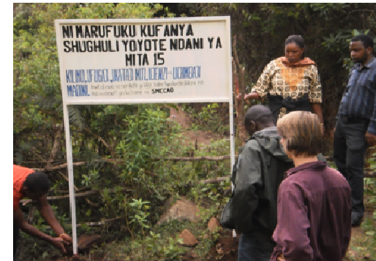
Demarcation of Kihama chini water catchment area in Vudee Village.