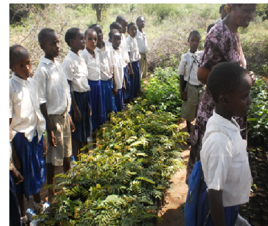
Tree Nursery of Kwakoa P/S Environmental Club